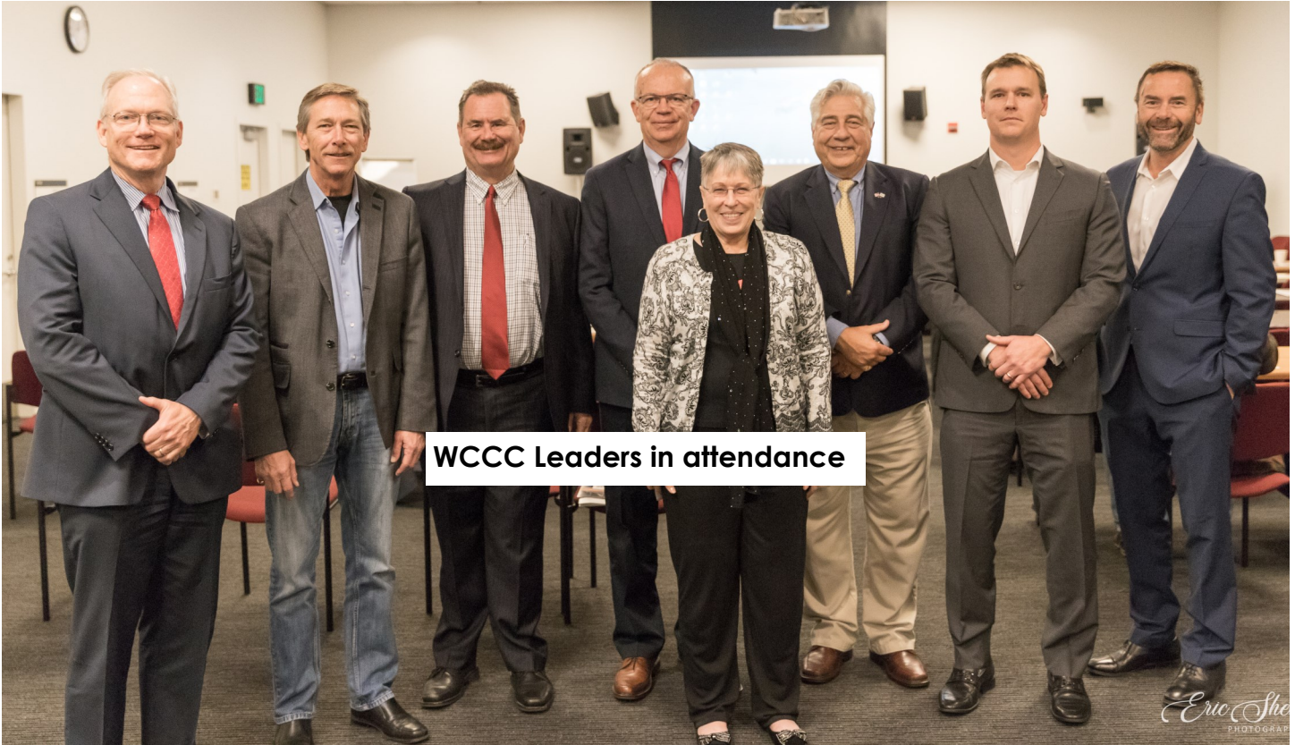
WCCC Leaders in attendance