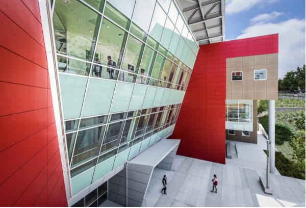
Saddleback College Interdisciplinary Science Center