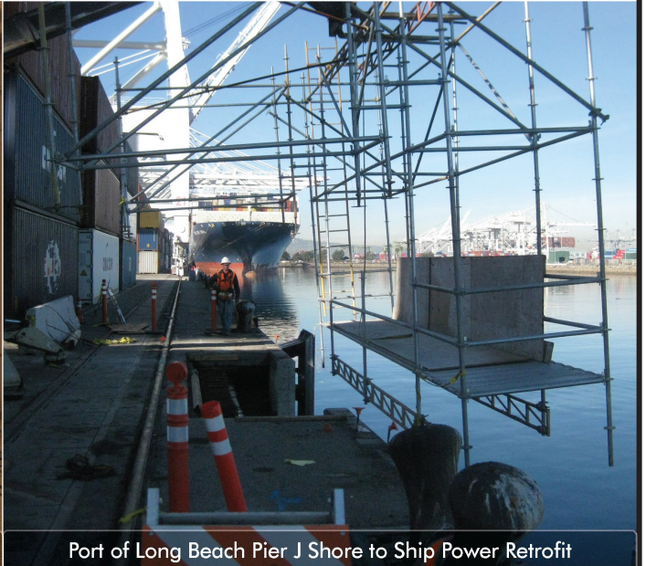
Port of Long Beach Pier J Shore to Ship Power Retrofit Significant Achievement Project Award

Working in every facet of the construction industry has provided Vanir with the intelligence and expertise needed to deliver award winning projects to our clients. We bring the best advice, the best service, and the best solutions each and every time.