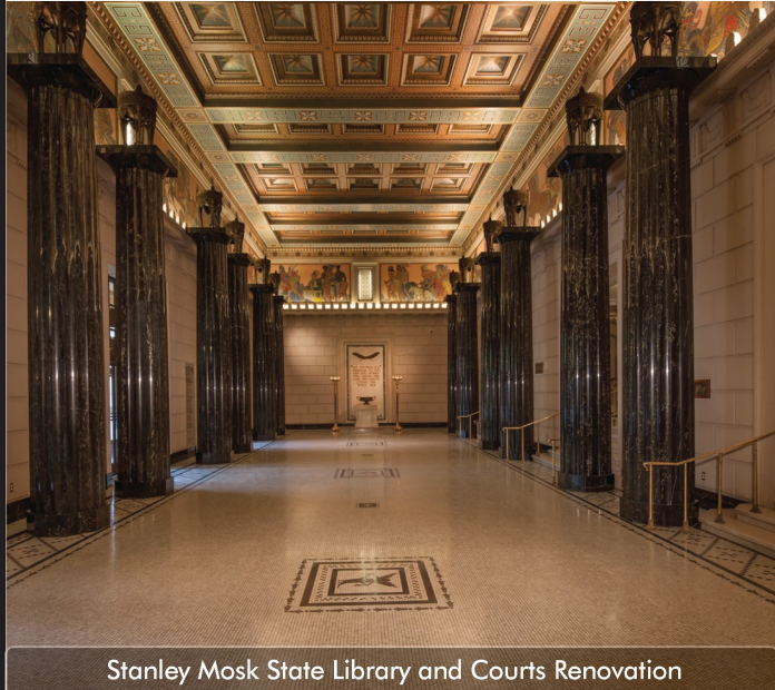
Stanley Mosk State Library and Courts Renovation Distinguished Project Award