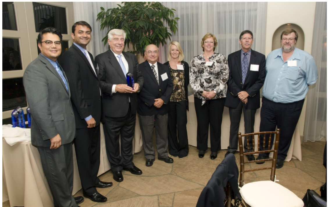
Exceptional Project John Wayne Airport Terminal C