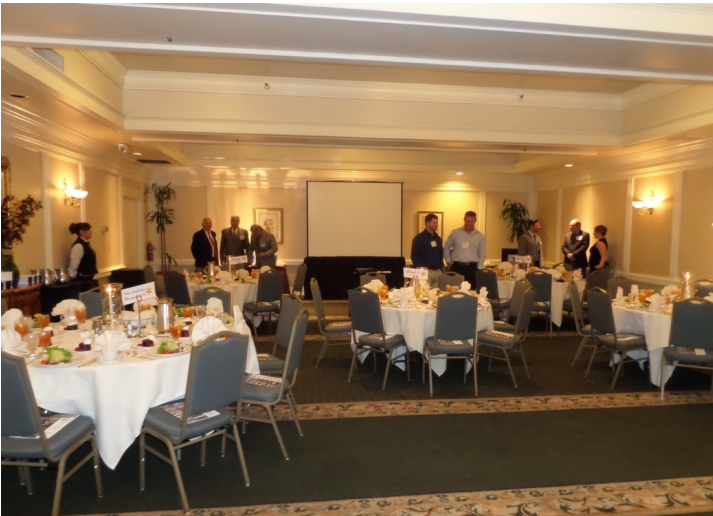
George Washington Room—Lafayette Park Hotel & Spa